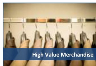
High Value Merchandise